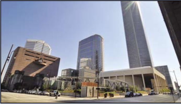
The Houston theatre district opens up with free performances, free food and backstage theatre tours