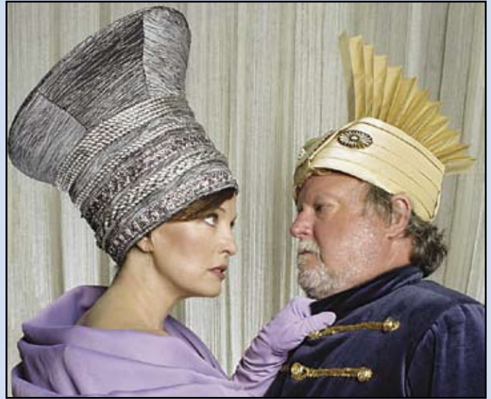
Shakespeare festival at Miller Outdoor Theatre