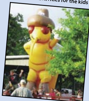
Great Mosquito Festival offers lots of fun activities for the kids

About 55 miles southeast of Houston, the Great Texas Mosquito Festival is scheduled to take place in Clute. Started to promote tourism to the area, the festival now attracts some 18,000 visitors. This three day event is filled with fun for