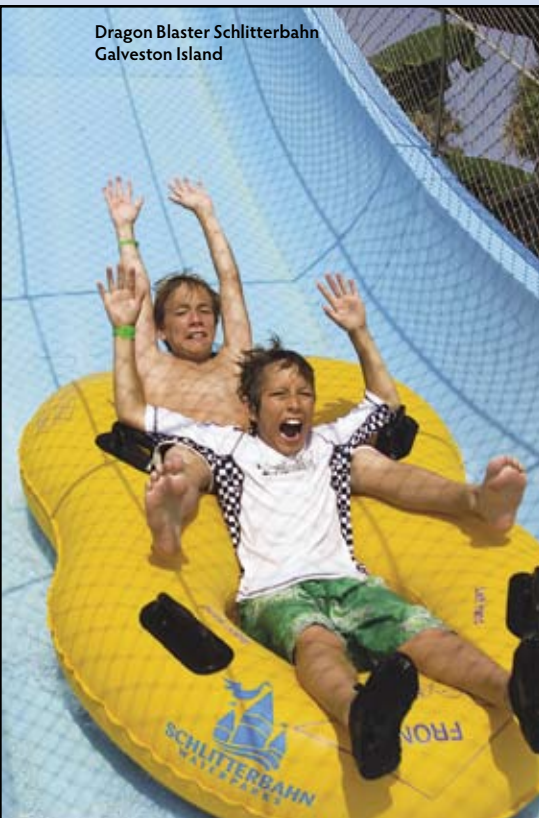
Dragon Blaster Schlitterbahn Galveston Island

© 2008 Katy Magazine and Sugar Land Magazine