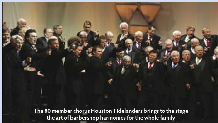
The 80 member chorus Houston Tidelanders brings to the stage the art of barbershop harmonies for the whole family

16029 City Walk • Sugar Land, TX • (281) 574-3585