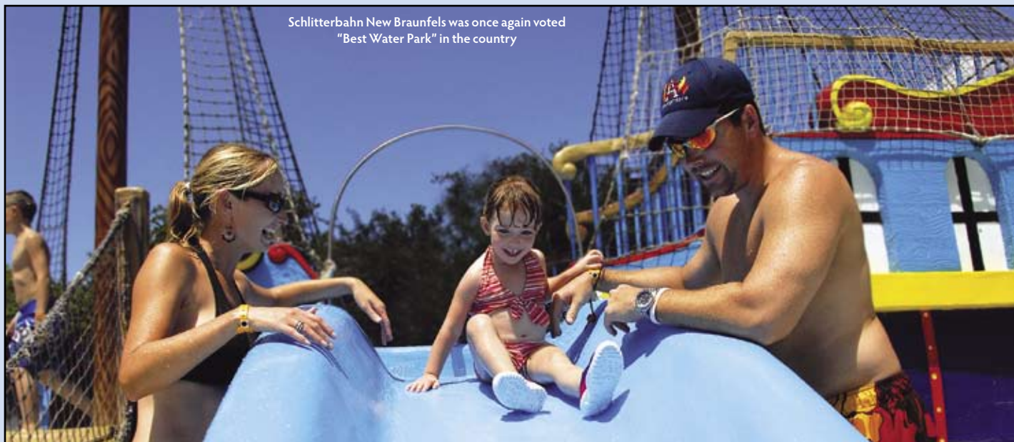
Schlitterbahn New Braunfels was once again voted "Best Water Park" in the country