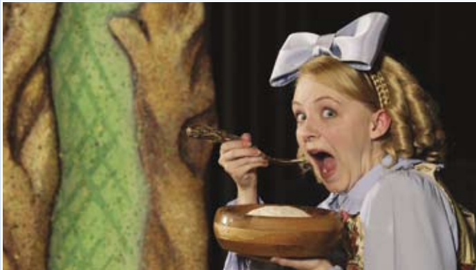
Goldilocks performed at Children's Theatre Festival

The little ones in your family will love this wonderful wading pool, complete with an ark waterslide and water-spraying animals. Located at Westpark and the Sam Houston Tollway, Noah's Ark is one of the many family fun recreational venues offered at The Quillian Recreation Center. Part of the First Methodist Houston, the center is open to the general public and provides facilities which include two lighted softball fields, an open air pavilion, soccer fields, a 400-meter fitness trail, playgrounds, and a 25-meter pool. For all the Center's attractions, visit fmhouston.com/quillian/quillian.aspx .