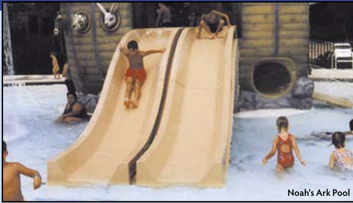
Noah's Ark Pool